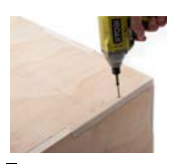
8 Use screwdriver or drill